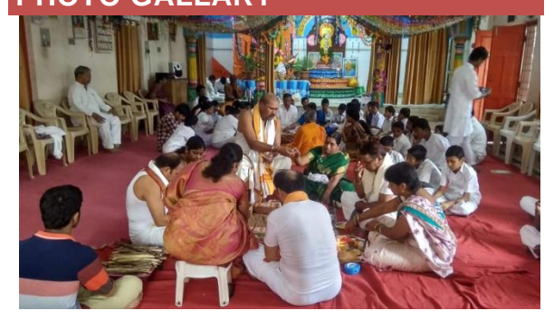
Community Yagnam on 16th Sept 2018 during Ganesh festival